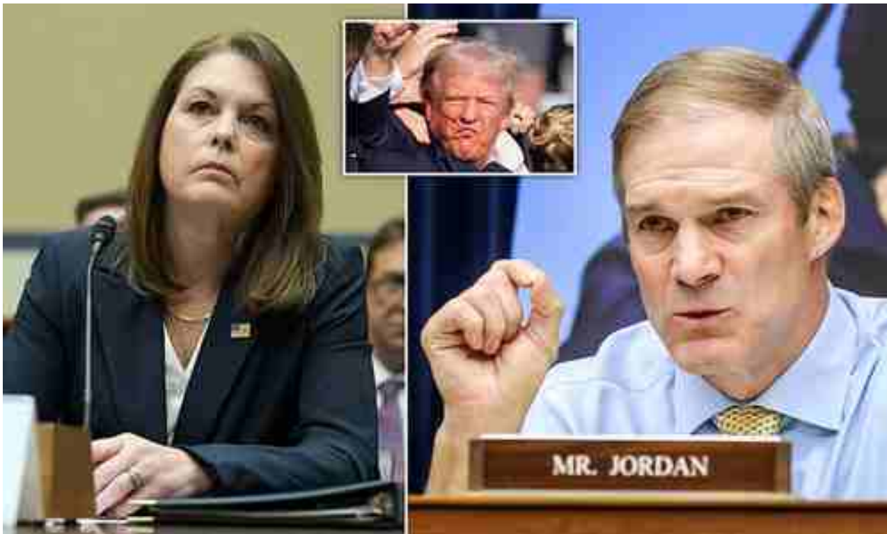
Watch the Secret Service director squirm during congressional hearing