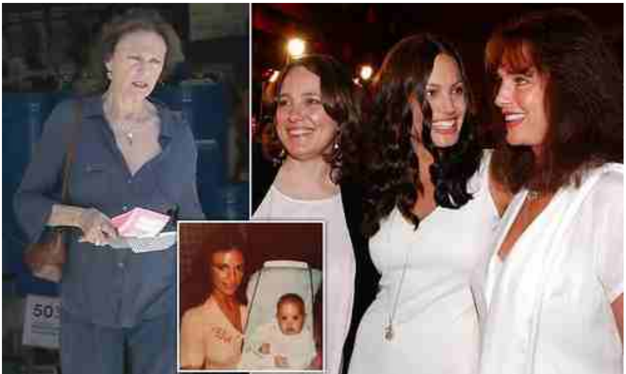
Angelina Jolie's reclusive Hollywood legend godmother breaks cover 49k viewing now