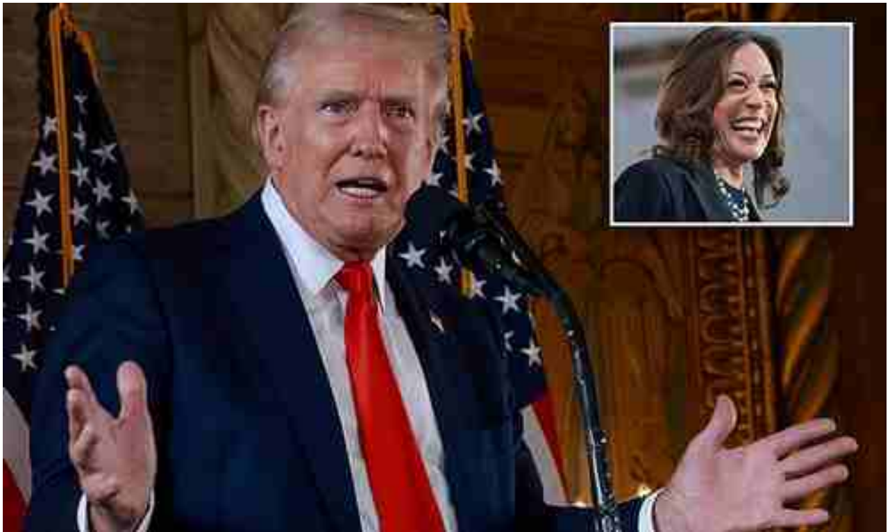
Trump repeats claims Kamala Harris 'recently' decided to be black 2k viewing now